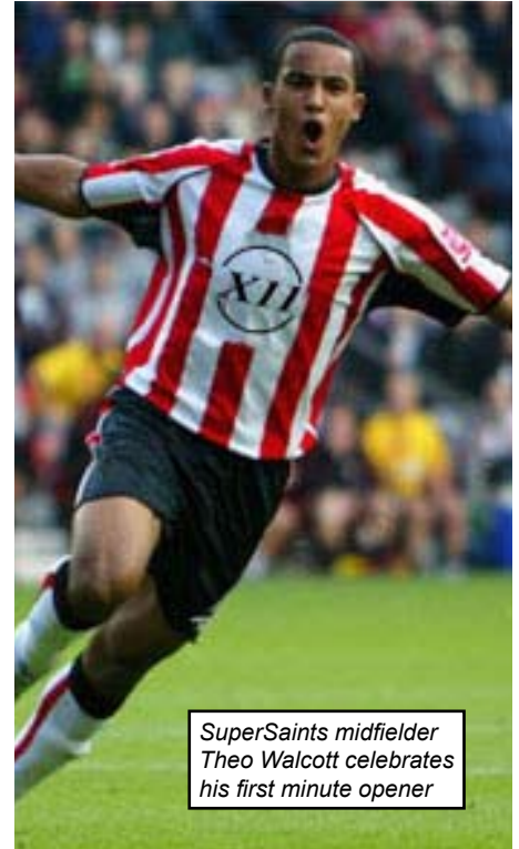
SuperSaints midfielder Theo Walcott celebrates his first minute opener