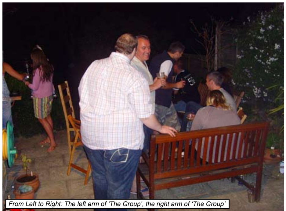
From Left to Right: The left arm of 'The Group', the right arm of 'The Group'

This caused unwanted tremors, tsunamis and earthquakes in parts of The Phillipenes and Malaysia. This has caused concern for all bosses as his presence at The Cove could see the attendance dropping from their normal 20,000 plus to just ONE.